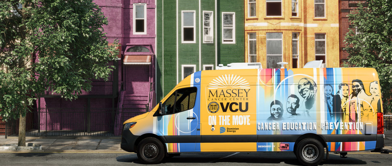
Massey on the Move mobile health van